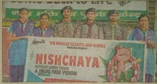
नशा मुक्ति केंद्र में पहुंचे रोवर्स एंड रेंजर्स ग्रुप के सदस्य।