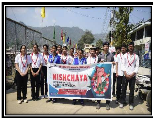
Note: Photographs of the activity