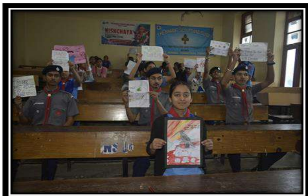
Note: Photographs of the activity