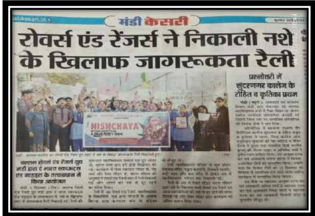
Note: Photographs of the activity

The rally, which aimed to raise awareness against substance abuse, commenced from the college campus, passing through Panchvaktra Temple in Paddal Colony, Tibetan Market, and ISBT Bus Stand Mandi, and concluded