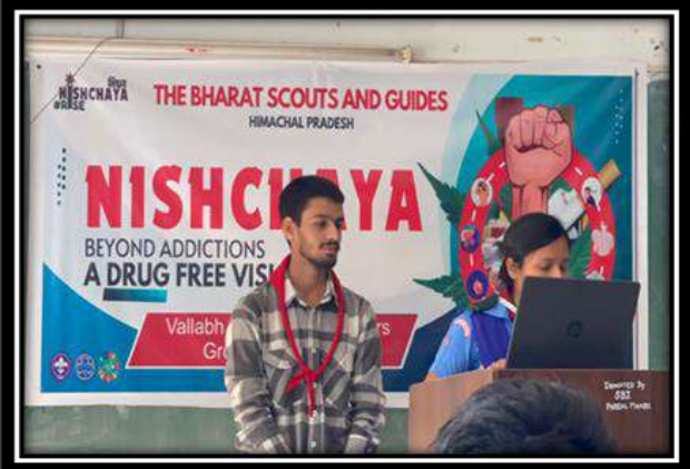
Note: Photographs of the activity