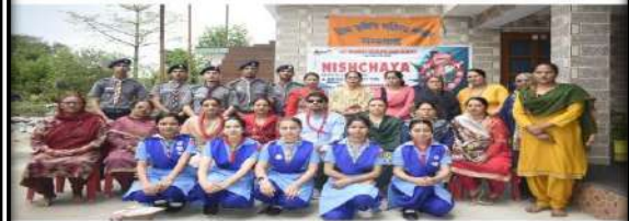
संवाददाता।