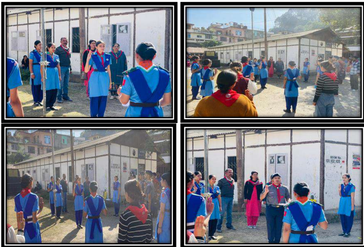
Note: Photographs of the activity

abuse and will try to keep others from it. In this activity, 48 Rovers and Rangers were present, along with the college staff and other students.