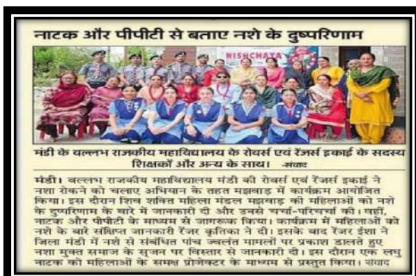
Note: Photographs of the activity