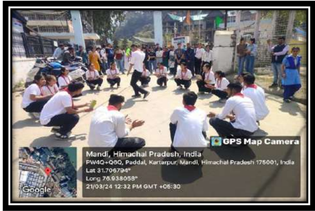
Note: Photographs of the activity

Link: - https://www.facebook.com/share/v/u8EqhRtePeCdJ1C4/?mibextid=jmPrMh